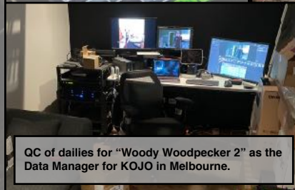
QC of dailies for "Woody Woodpecker 2" as the Data Manager for KOJO in Melbourne.